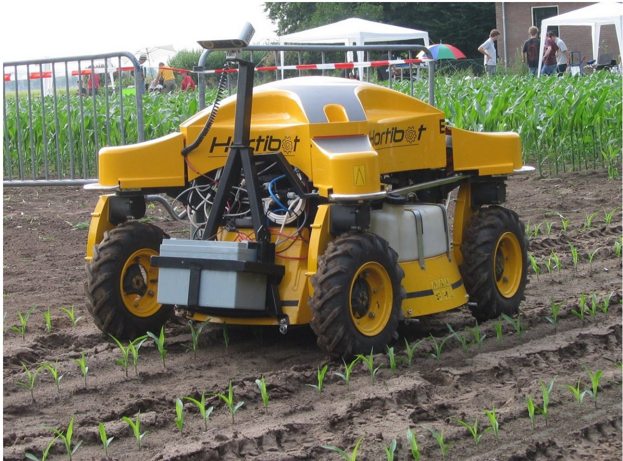
A prototype robotic weeder