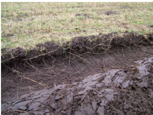
Rhizomes of Elymus repens

Currently two major weed problems put severe constraints on organic crop production in Denmark: